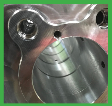
Enclosed Cam Tunnel with Internal Drain.