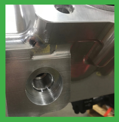
Lifter Valley/Cam Tunnel Scavenge Drain Fitting.