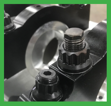
9/16 Inner Main and ½ Outer Main Studs.