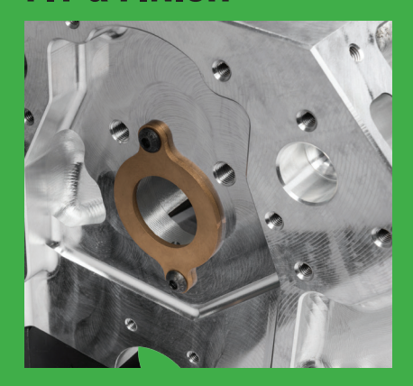
Standard or raised 55mm babbit to 60mm roller cam options, bronze material cam thrust plate included.