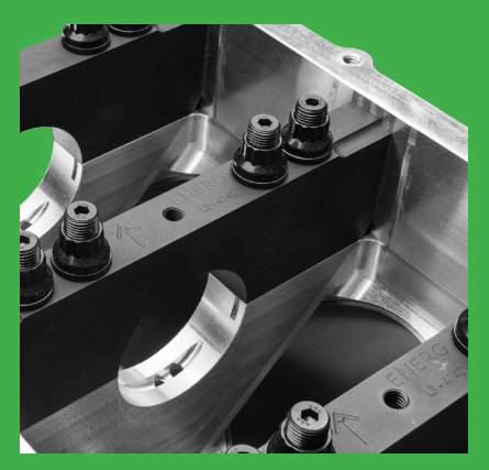
4140 steel billet main caps, ARP main studs with enhanced oiling features.